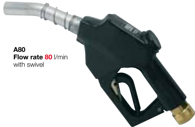
A80 Flow rate 80 l/min with swivel