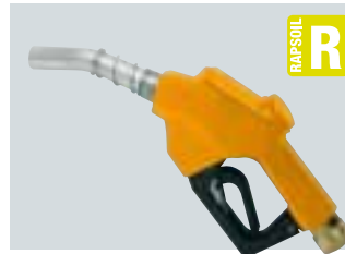
RAPSOIL nozzle available

Lubrication Solutions Inc 19703-B Eastex Freeway #100 Humble TX 77338 Phone: 281-619-8109 www.lsidef.com