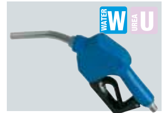
UREA nozzle available