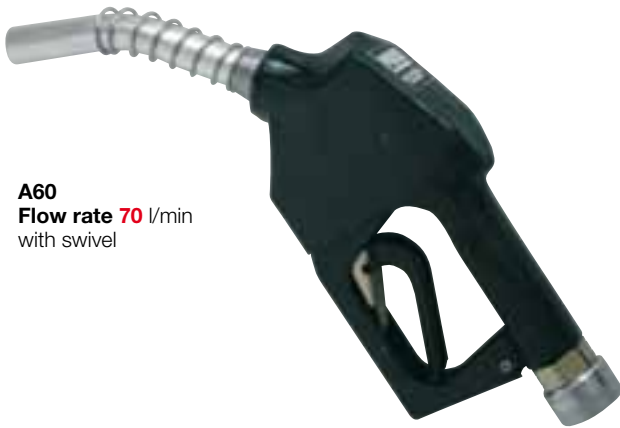
A60 Flow rate 70 l/min with swivel