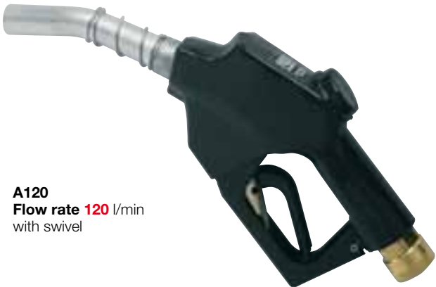
A120 Flow rate 120 l/min with swivel