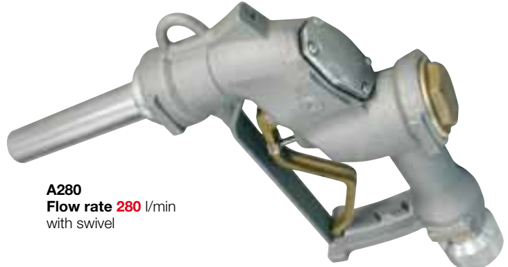
A280 Flow rate 280 l/min with swivel