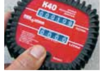
Mechanical counter with total-partial resetting.

Meter body in die-cast aluminium to withstand high pressure. Input/output 1/2" GAS (NPT) Nozzle with: trigger protection to avoid accidental operations. Input with rotating 1/2" Gas (NPT) attachment and incorporated filter. Rigid or flexible end with automatic drip proof valve.