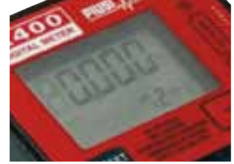
Multifunction display. 5 digit partial. Total. Resettable total and calibration available. Low battery icon.

Rigid or flexible end with manual non drip valve.