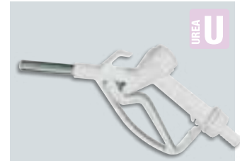
UREA nozzle available

Lubrication Solutions Inc 19703-B Eastex Freeway #100 Humble TX 77338 Phone 281-619-8109 www.lsidef.com