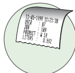
Ticket printer integrated