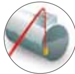
Level indicator integrated